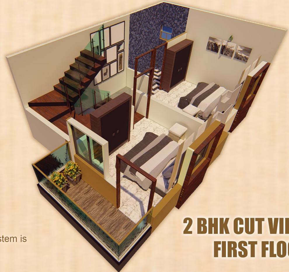
2 BHK CUT VIEW FIRST FLOOR